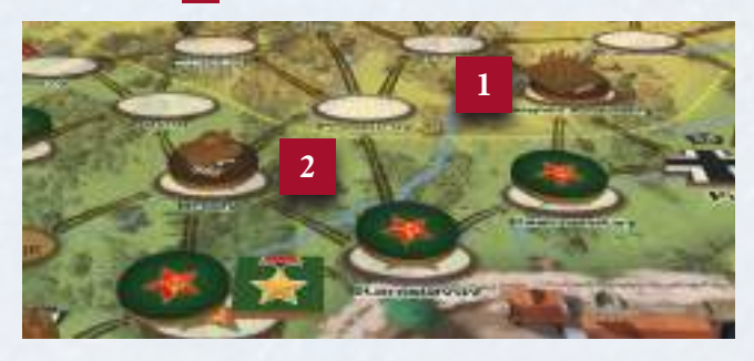
1 Panzergruppe continues its movement through Proskurov 3. Then, the player removes the Soviet markers from Lvov, Stanislavov, and Czenovitsy and replaces them with his player markers, because these areas have been cut off from all of the Victory Areas. Also, the three top cards

Next, 1 Panzergruppe, after a successful combat, captured Brody 2.