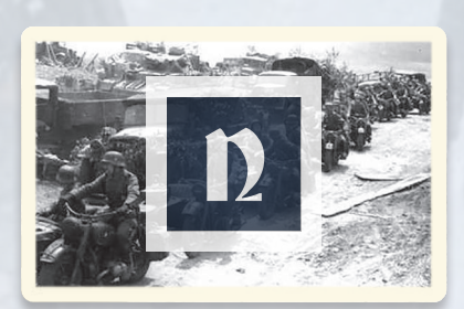
Gray – Army Group "Nord" (North)

During the game, you use your Army cards and your deck of Pursuit cards, which are marked with your own player color: