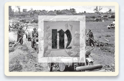
White – Army Group "Mitte" (Center)