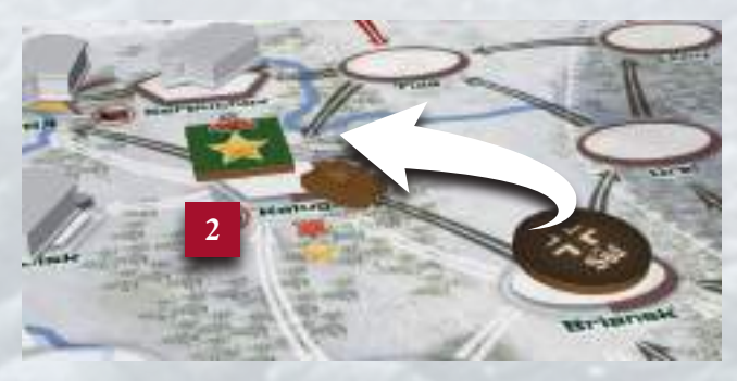
Kaluga has a medal, which the player collects and adds to his resources.

adds the defeated Soviet card to his resources and puts a brown player marker into Kaluga and removes bunker miniature to the box.