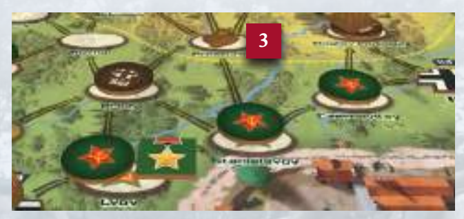
from the Soviet deck are removed (without being revealed) and added to Brown's resources. Brown also receives the medal for capturing Lvov.