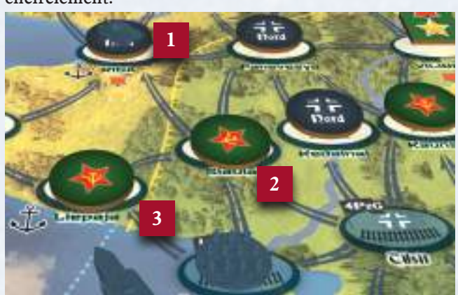
EXAMPLE: 4 Panzergruppe has just captured Riga 1. Soviet markers in Siaulai 2 and Liepai 3 are not encircled, since Liepaja has a harbor and an unblocked sea connection to Leningrad.

A Soviet chain of communication can be also traced by sea areas if there is a Harbor in each of the areas connected. Note that red arrows may prevent such areas from encirclement.